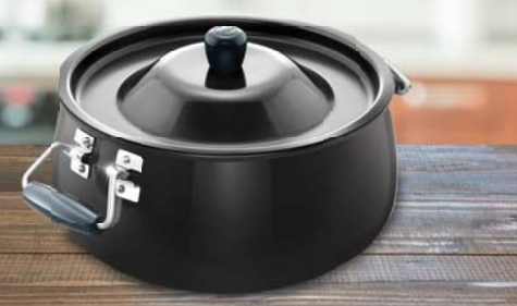
BIGBOY BIRYANI HANDI

DISCOUNT OFFER FOR HAWKINS SHAREHOLDERS 2024