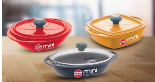
DIE-CAST MINI CASSEROLE