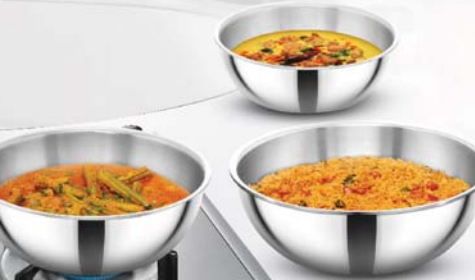
METRO KADHAI (TASLA)