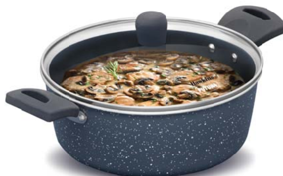
COOK n SERVE BOWL