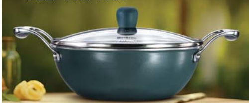
OLIVE PRO TRI-PLY DEEP FRY-PAN