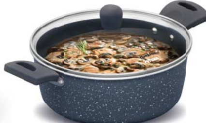
COOK n SERVE BOWL