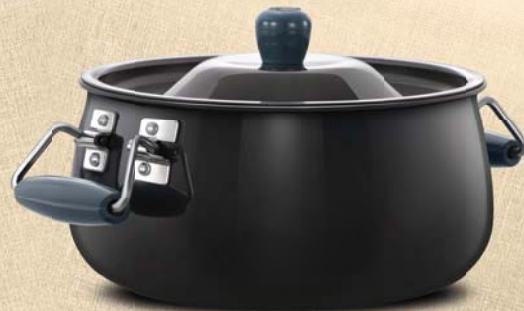
Hard Anodised Biryani Handi 8 Litre