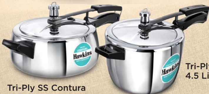
Tri-Ply SS Contura 3.5 Litre