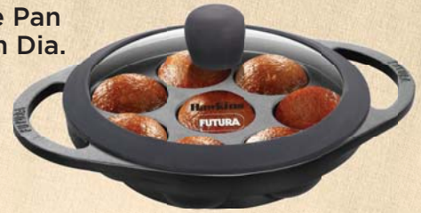
Cast Iron Appe Pan 16 cm Dia.