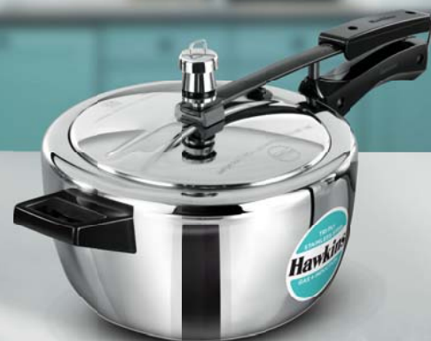
TRI-PLY STAINLESS STEEL