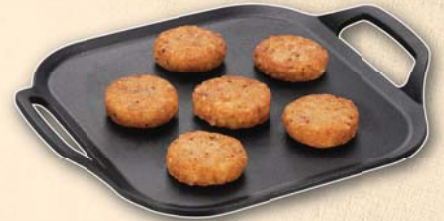
Cast Iron Square Tava 26 cm Dia.