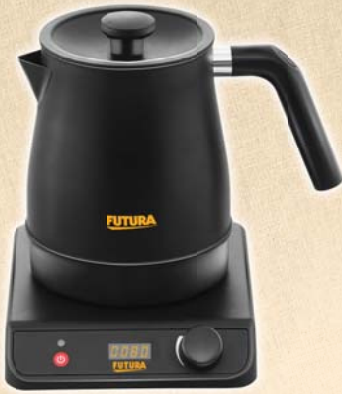
Electronic Kettle 1.4 Litre