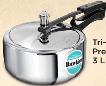
Tri-Ply Pressure Pan 3 Litre