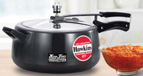
CONTURA BLACK XT