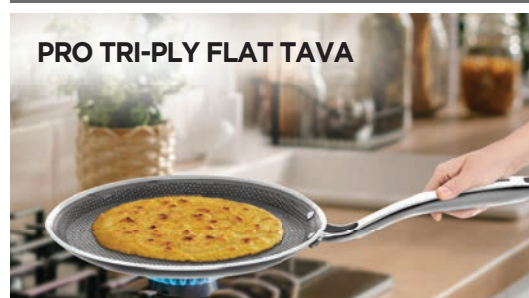
PRO TRI-PLY FLAT TAVA