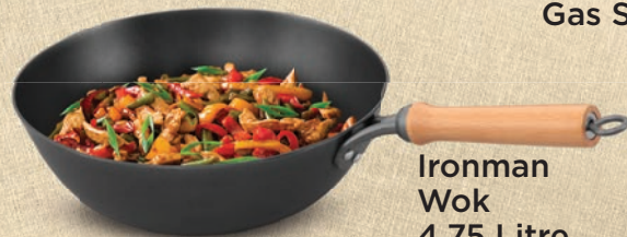
Ironman Wok 4.75 Litre