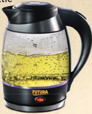
Electric Glass Kettle 1.8 Litre