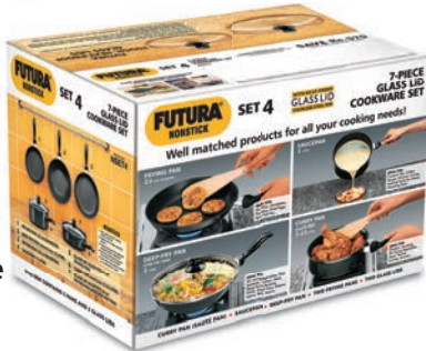
Nonstick Cookware Set