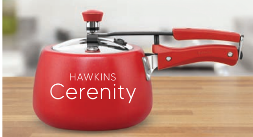
CERENITY SPRING COLLECTION