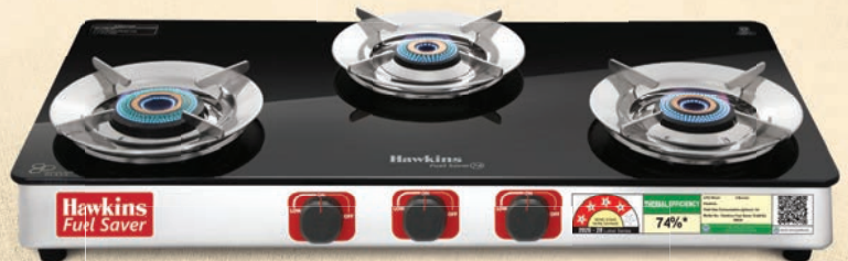
Hawkins Fuel Saver Gas Stove