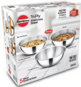
Tri-Ply Metro Kadhai (Tasla)