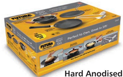
Hard Anodised Premium