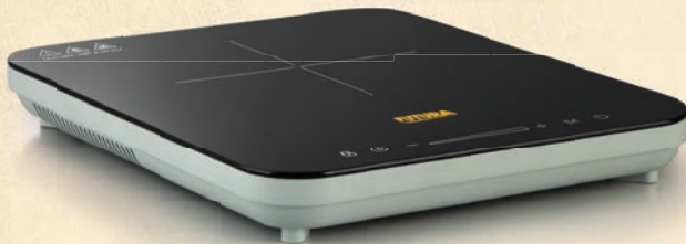
Single Hob Induction Also Available in Dual Hob