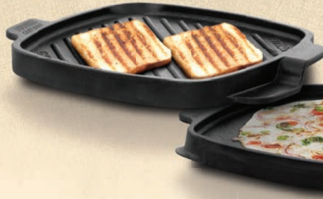
Reinforced Cast Iron Grill n Griddle 26 cm Diag.