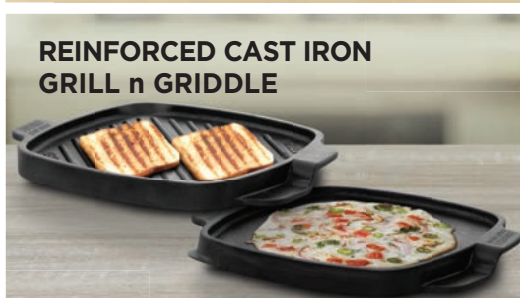
REINFORCED CAST IRON GRILL n GRIDDLE