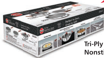
Tri-Ply Shielded Nonstick