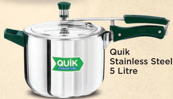
Quik Stainless Steel 5 Litre