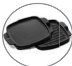
2-in-1 1 Tava 2 Surfaces