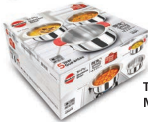
Tri-Ply Metro Patila