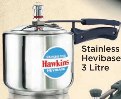
Stainless Steel Hevibase 3 Litre