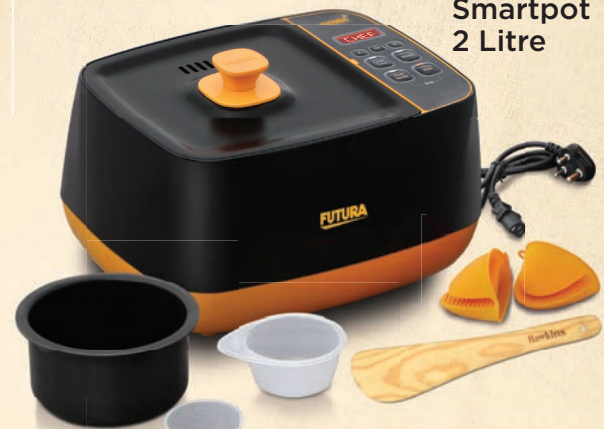
Smartpot 2 Litre