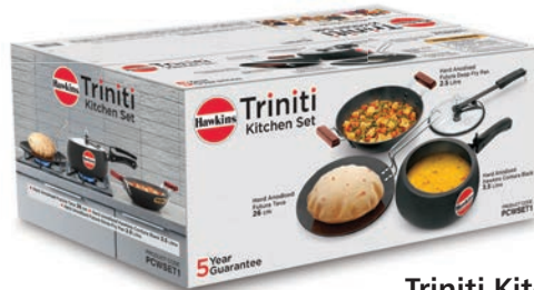
Trinitri Kitchen Set