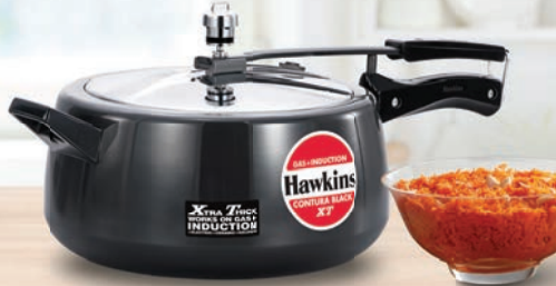
CONTURA BLACK XT