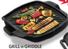
GRILL n GRIDDLE