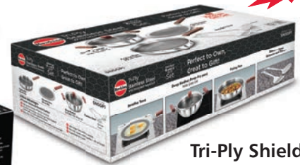
Tri-Ply Shielded Nonstick