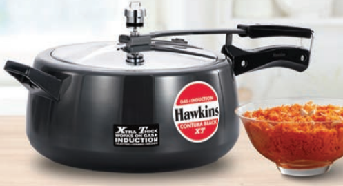
CONTURA BLACK XT