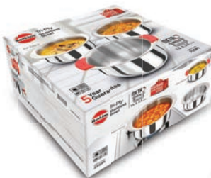
Tri-Ply Metro Patila