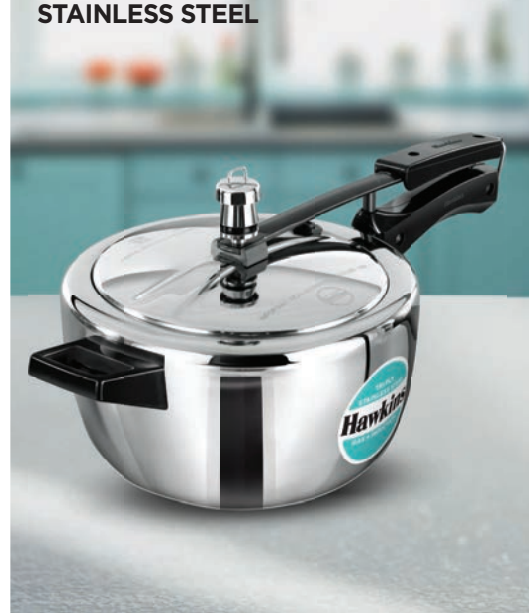
TRI-PLY STAINLESS STEEL