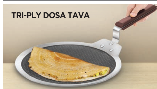
TRI-PLY DOSA TAVA