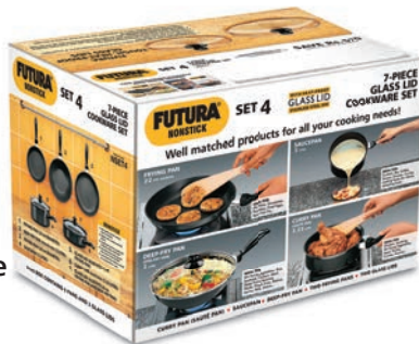
Nonstick Cookware Set