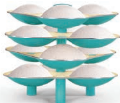
Aqua Idli Stand

Make 12 or 18 delicious, fluffy idlis at a time – in 6 minutes! Each Hawkins Idli Stand comes with full instructions on how to make idli, chutney and sambar. Choose from the five models listed in the table.