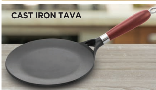
CAST IRON TAVA