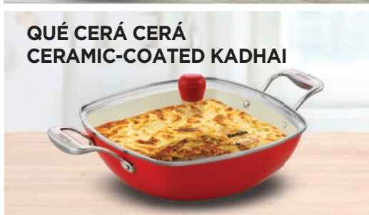
QUÉ CERÁ CERÁ CERAMIC-COATED KADHAI