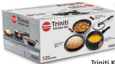
Trinitri Kitchen Set