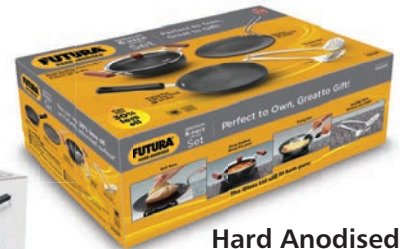
Hard Anodised Premium