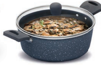
COOK n SERVE BOWL