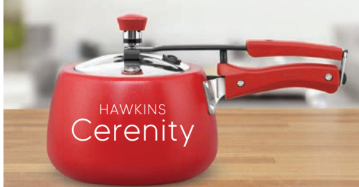
CERENITY SPRING COLLECTION