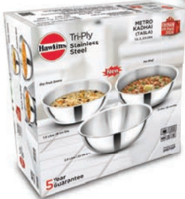
Tri-Ply Metro Kadhai (Tasla)